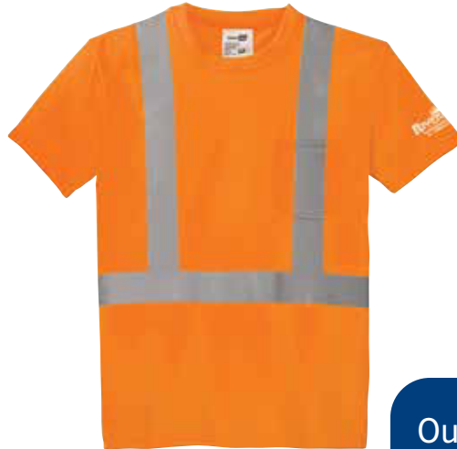
Construction & Safety Wear Pages 38-39