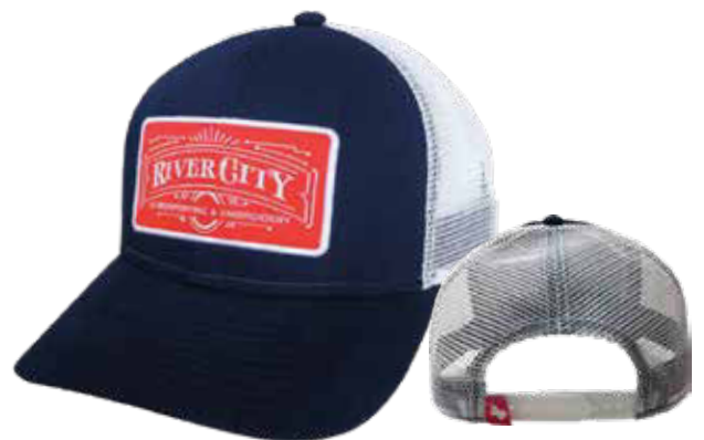
Custom Mesh Back Cap with Woven Patch and Custom Back Tag.