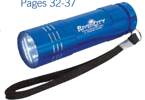
Promotional Items Pages 32-37