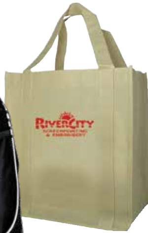
Bags & Totes Page 28