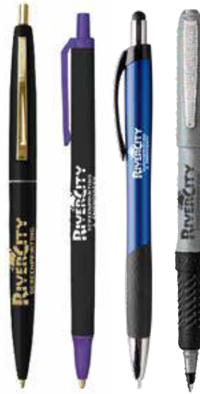
Pens Page 29