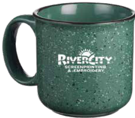
Drinkware Pages 30-31