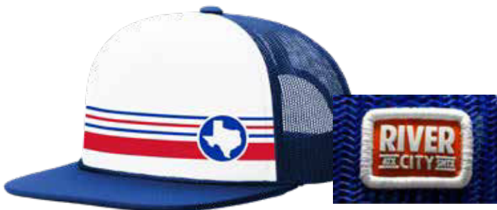
Custom Foam Trucker with Screenprinting and Rubberized Tag.