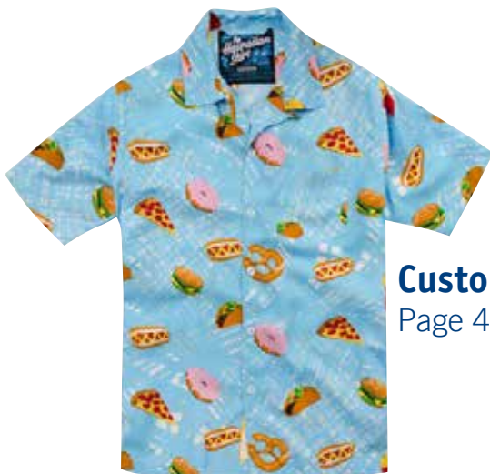
Custom Apparel Page 40